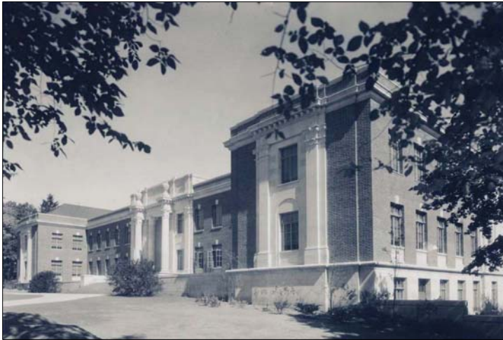
Home Economics building

Federal funding also provided higher educational funding for veterans under the “GI Bill.” Many veterans who had interrupted their education to join the military took advantage of that funding to complete their college programs. The Department had many returning veterans who received a baccalaureate degree under the “GI Bill.”