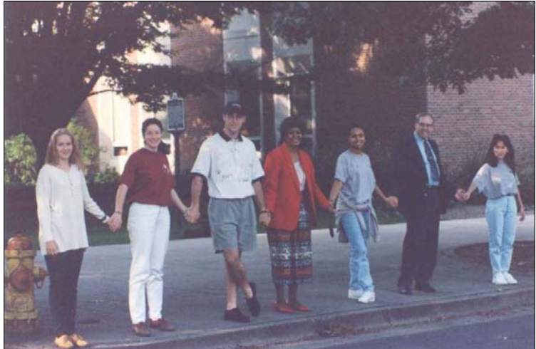
AEE faculty and students participating in the “Hands across the Campus” event, 1997