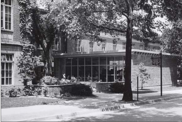
Creamery, current location