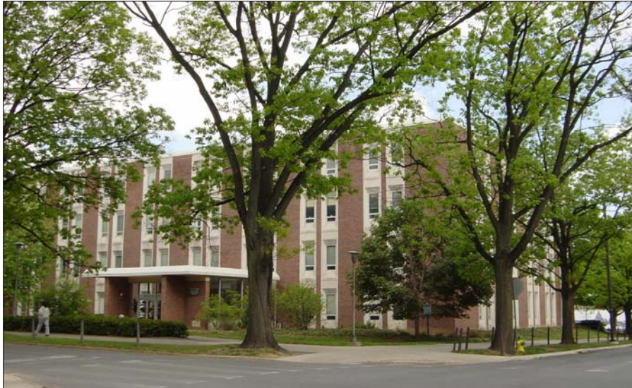
Agricultural Administration Building, 2005

The Department from 1990 to the present had significant changes. These included: changes in the Department's leadership position; in 1991, a strategic planning cycle was initiated; preparation for a comprehensive external review of the Department started in 1994 and the external team conducted the review on March 13-16, 1995; undergraduate an environment education option was made available in 1991; the undergraduate leadership development and communication major and the undergraduate leadership development minor were approved May 2000 and the first class was offered summer 2000; and the Pennsylvania FFA celebrated its 65 th birthday.