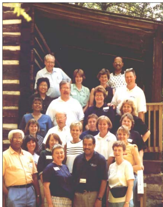
The Department 2001 faculty and staff retreat