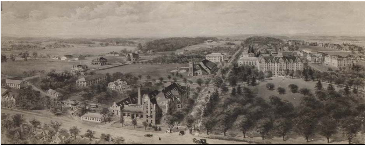
A view of the Pennsylvania State College campus, a copy of the 1910 lithography.